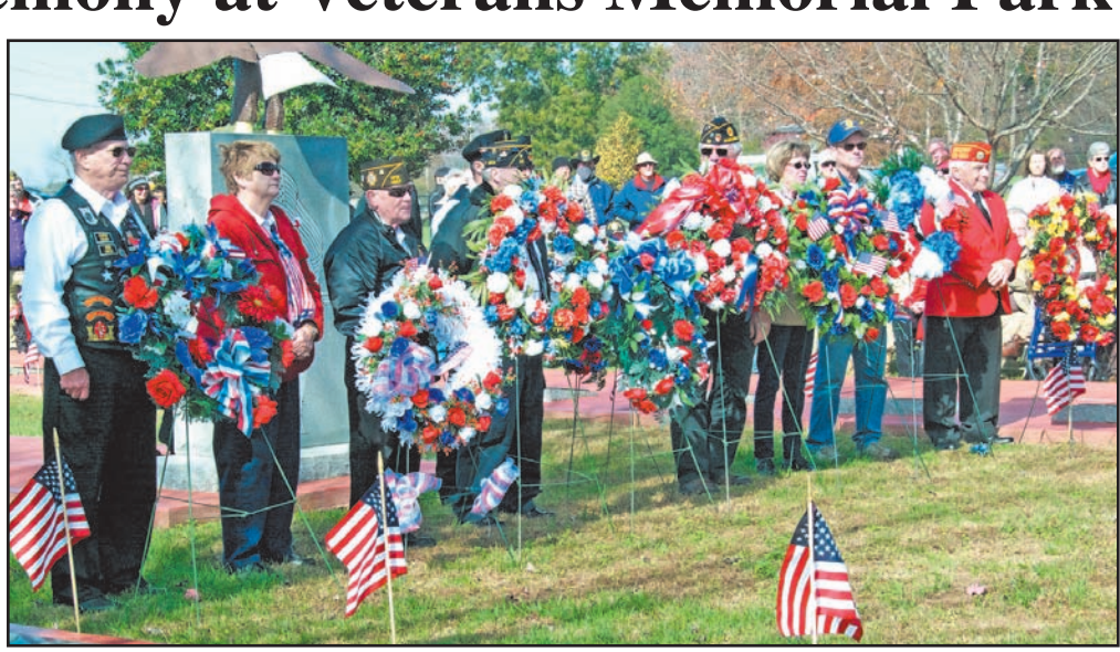
The Laying of the Memorial Wreaths in the 2017 Towns County Veterans Day Ceremony.